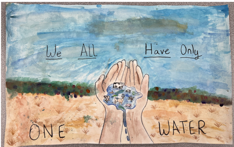
Poster by Paizley Zutavern